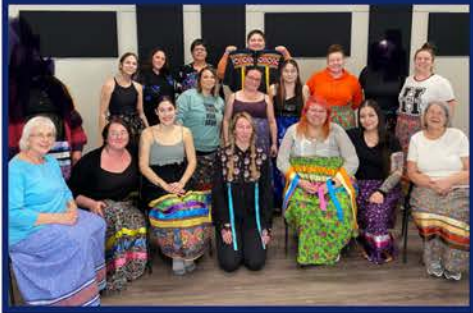
Below: DTI Office Administration Class sewing workshop.