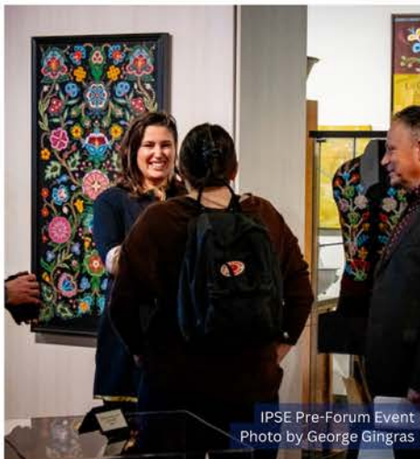
IPSE Pre-Forum Event

An important aspect of the forum was the inclusion of Knowledge Keepers,